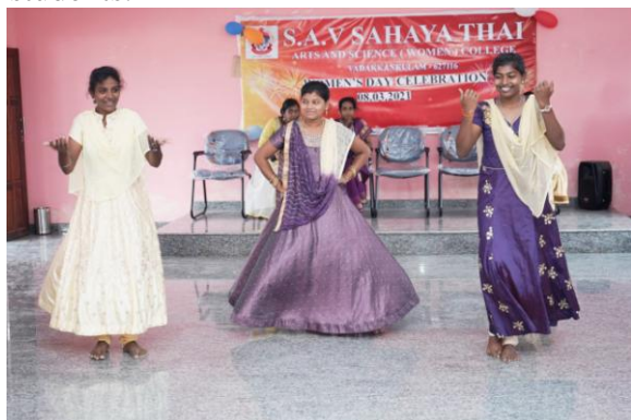
The students participated in various cultural activities like song, dance etc.