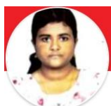
S.Sahnas Sheeba I Mathematics.

1. If 531 = 127 , 452 = 146 , 316 = 727 , then 725=?