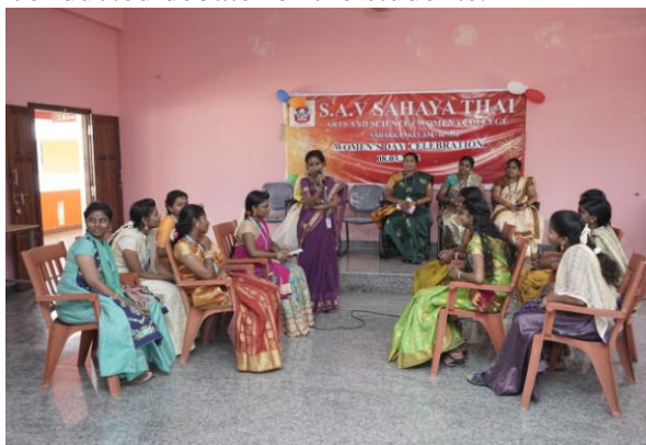
Quiz competition was also conducted for the students.