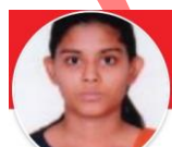
J.Jenosha I Mathematics.

looked green in colour. The coconut tree said that its products were used for cooking. The sunflower said that its seeds were used to make oils. The cactus was very sad. Days passed by and the seasons changed. It was summer season. All the plants and trees were very thirsty and they looked very dull. The cactus plant remained as fresh as it was in the spring season. They were very much interested in knowing the secret and asked the cactus plant the reason for its freshness. The cactus plant replied that it would never feel thirsty because of its fat leaves. Water would be stored in that leaves. The moral of the story is that everyone is endowed with special talents and is unique with his or her own skills.